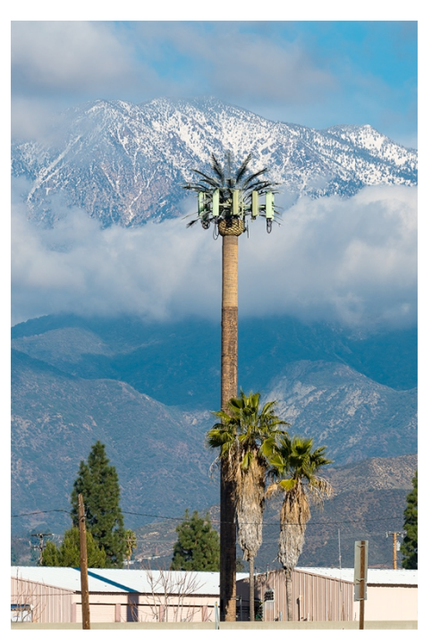
High School Track, San Lorenzo, CA / Palm in Winter, Calimesa, CA