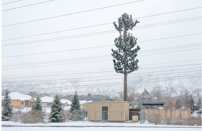
The Middle Cross, Mesa, AZ / Snowfall, Provo, UT

The often-whimsical tower disguises so artfully documented by Burke belie the equipment's covert ability to collect valuable personal data transmitted from our cell phones. This poses the question: how much of our privacy are we willing to sacrifice in exchange for better connectivity? In addition to privacy issues these towers also pose a threat to the environment. Burke writes that " ... the leaves drop off the fake trees due to weather and aging. They litter the surrounding area and small pieces can easily enter the ecosystem."